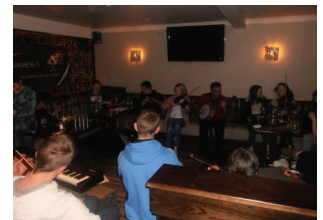
Junior Session at Darkie Moores—Leixlip

Adult Sessions November 13, 27 December 11