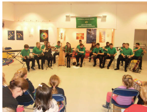
Performance for Culture Night Leixlip Public Library