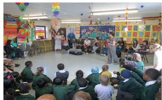
Recruitment drive at local Primary schools – St. Patrick's Primary school